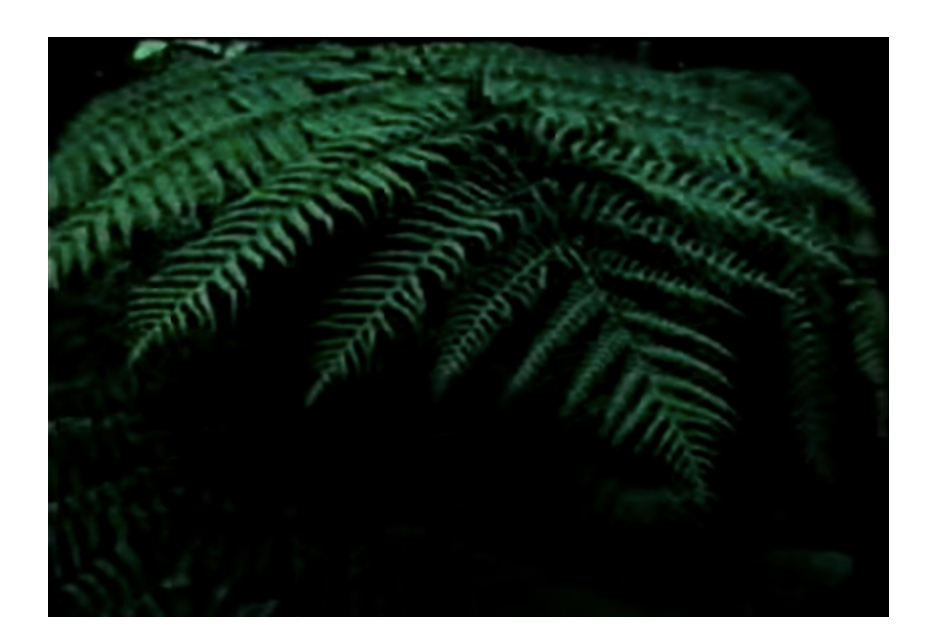
Figure 3: Photosynthesis (2000, dir. Joe Castrucci)